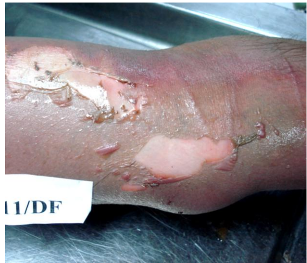
Fig:2 Desquamation of skin and erythema on left elbow

Mid arm circumference was 25 cm on the right side and 30 cm on the left side. There were two areas of loss of superficial skin on the left axilla which were small ( 1 \times 0.5 cm and 0.2 \times 0.2 cm), circular and consistent with that of an insect bite. (Fig: 3) The subcutaneous tissue was necrotic while on deep dissection the underlying muscle appeared normal. (Fig: 4)