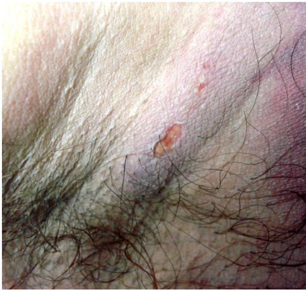
Fig: 3 Site of insect bite in the left axilla