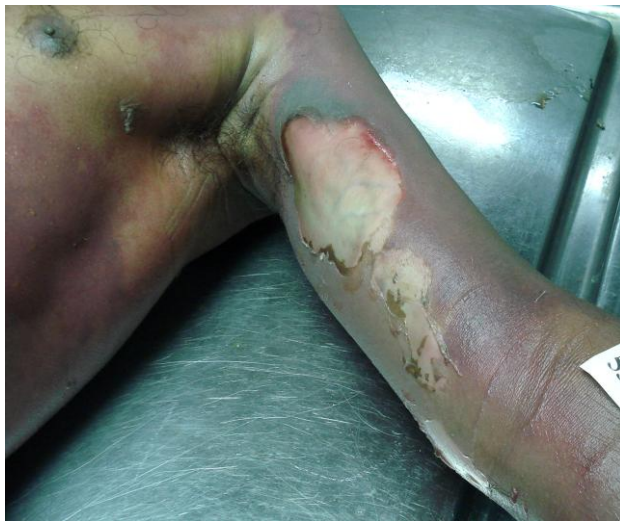
Fig:1 Swelling and desquamation of skin on left arm

Post-mortem examination revealed swelling and desquamation of skin and erythema on left arm extending to below the elbow. (Fig: 1 & 2)